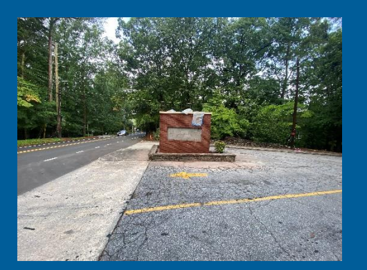
Front Entrance Ready for Sign and Lettering